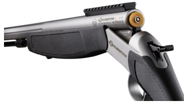
Firestick™ correctly inserted in CROSSFIRE chamber and primed